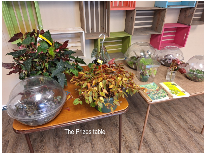
The Prizes table.