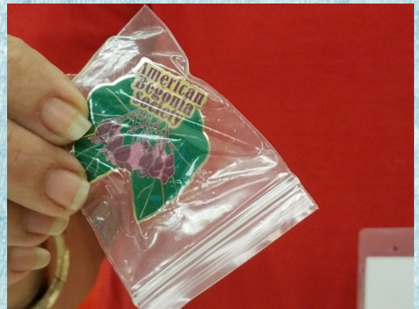
American Begonia Society pin