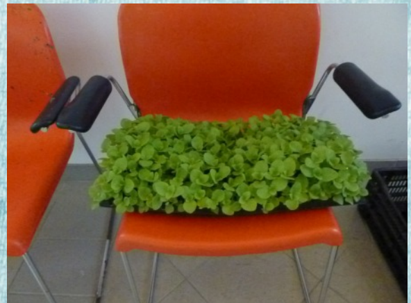
Lime coleus seedling donated by JJJ Greenhouses.