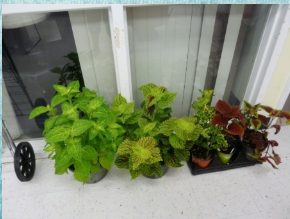
Coleus brought to the meeting for members.