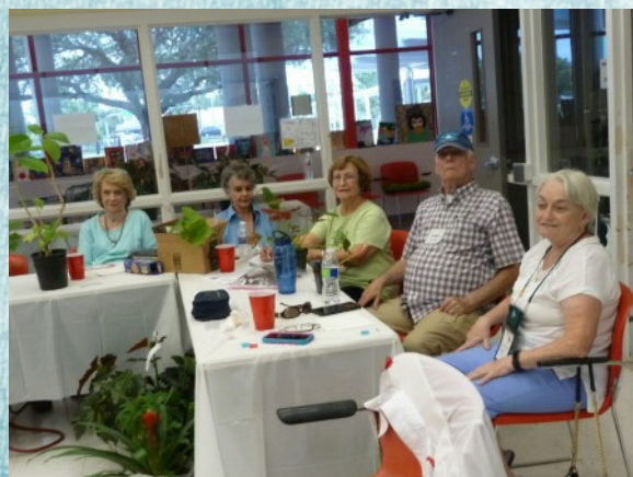
Members socialize while waiting for their number to be called.