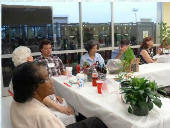
Members waiting for their raffle numbers to be called.