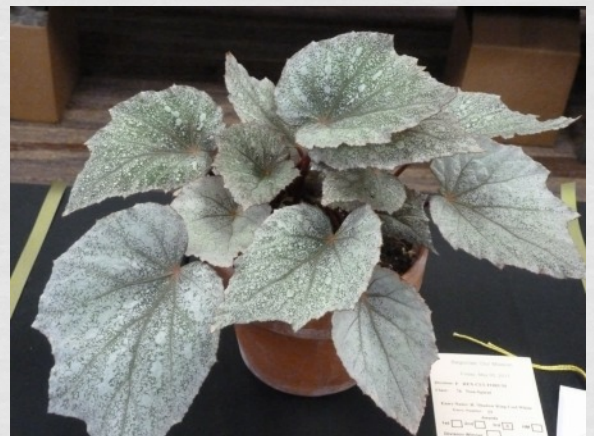
B. ‘Shadow King Cool White’