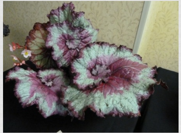
New Introduction B. ‘Harmony’s Daccaerys’