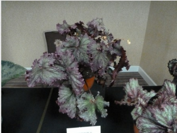
New Introduction B. ‘Harmony’s Dragon Fire’