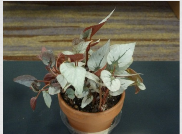
B. ‘Silver Limbo’