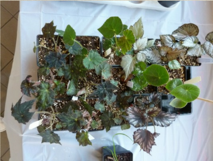
Plants for sale