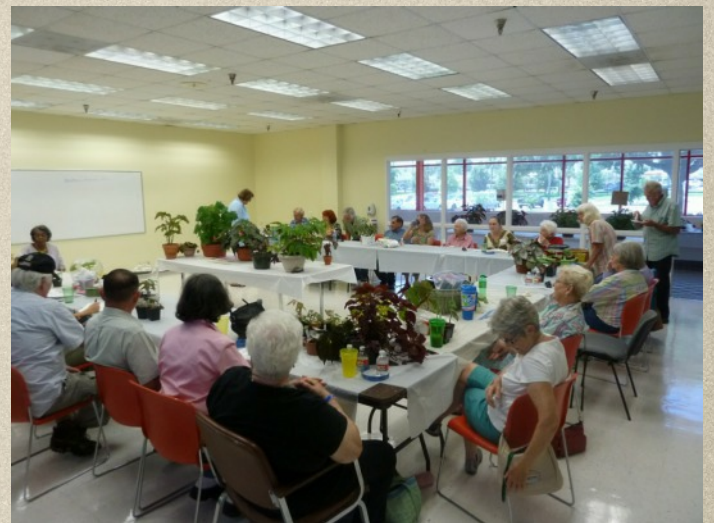
Astro's meeting in session.