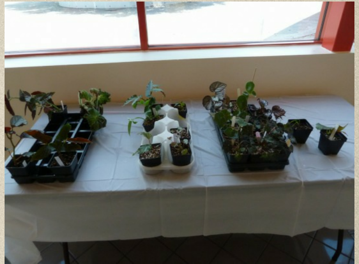
More plants for sale