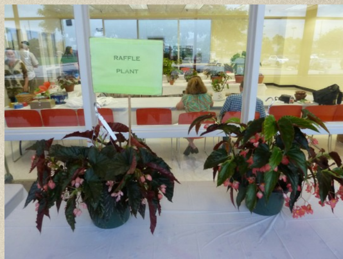
Raffle plants: B. 'Hot Tamale' (left) B. 'Down Home' (right)