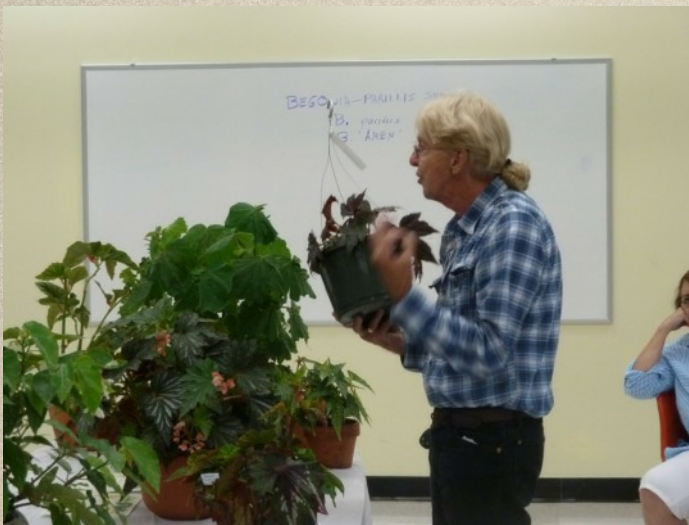
Who's plant is this?